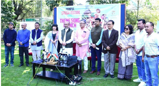
IT News Imphal, Nov 8: