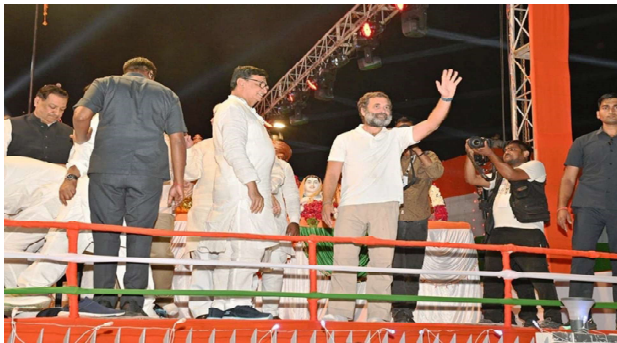
Congress leader Rahul Gandhi at Degloor in Nanded as he began his Maharashtra leg of Bharat Jodo Yatra on Monday.