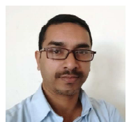
By: M.R. Lahu

Senior Congress leader Shivraj Patil's discovery of Jihad in Bhagavad Gita was not in tune with what his party understands about the holy text. This was probably visible when his party distanced itself from his statement and agreed to term his assertion on the Hindu holy text as unwarranted and baseless. It is improper to cross check the Congress sentiments on what the Gita professes. But the party's sensibility to outrightly reject its leader's senseless clamour on the Hindu religious text should be seen as an approach it began to feel appropriate and secular. Patil served as union minister in the Manmohan-led UPA government from 2004 to 2008.